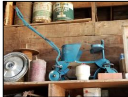
Typical display example. GUESS WHO MAY HAVE RIDDEN IN THIS STROLLER?

In addition to our hosting of the flea market, our historical society building was open to the public and the Main Street Diorama was on display in our newly finished reception room. Overall, all expectations were met, and our plan is that next year's celebration will be even better.