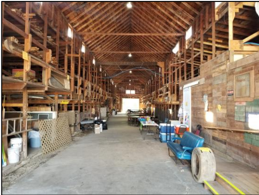
The center corridor of the Historical Societies home, known as the "Alley" reflects an architectural beauty with lots of space for future displays. Lots more in the coming month's folks! Stay tuned, or better yet, join the team.