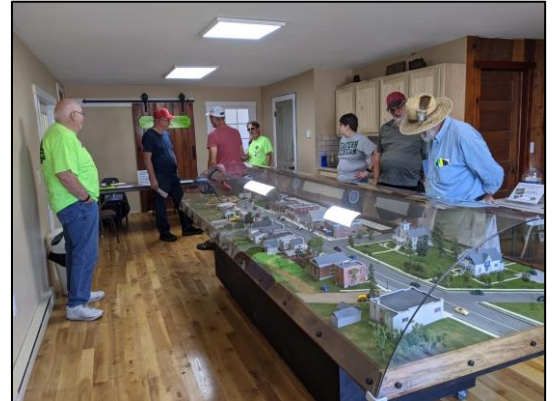
Our newly finished reception room with the adjacent future genealogy center, currently houses the replica diorama of Port Hope's Main Street, as it was in the 30's and 40's.